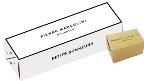
Case of 3 Petits Bonheurs

Feuillantine and whole hazelnuts combined with a homemade praline, with a touch of Maldon salt