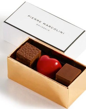
Box of 3 chocolates