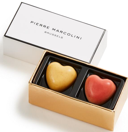
Box of 2 chocolate hearts (raspberry & passion)