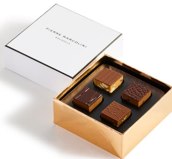
Assortment of 4 pralinés