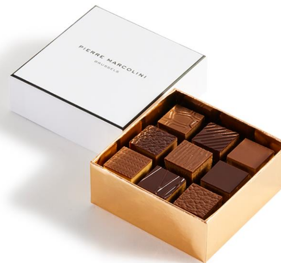
Box with 9 Pralinés Anciens d'Aujourd'hui