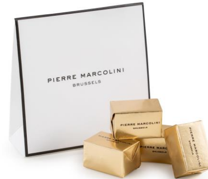
Sleeve of 4 Petits Bonheurs