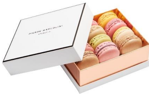
Box of 12 units