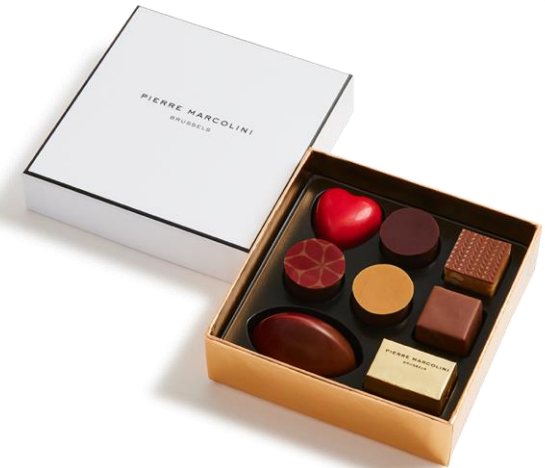
Mini Malline 8 units