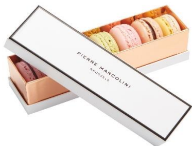
Box of 6 units

14 recipes of homemade macaroons made from original ingredients and natural colourings