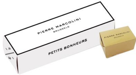
Case of 3 Petits Bonheurs

Feuillantine and whole hazelnuts combined with a homemade praline, with a touch of Maldon salt