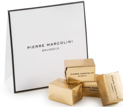
Sleeve of 4 Petits Bonheurs