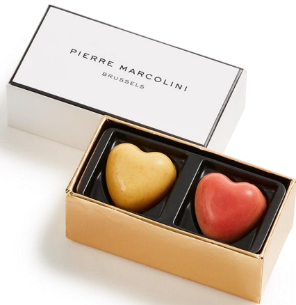
Box of 2 chocolate hearts (raspberry & passion)