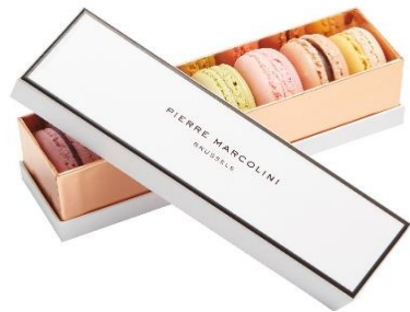
Box of 6 units

14 recipes of homemade macaroons made from original ingredients and natural colourings