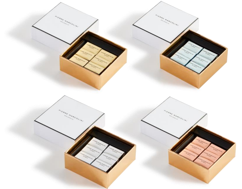
Box of 6 Petits Bonheurs